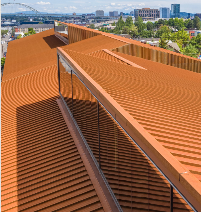
Redfox Commons, Portland, OR Featuring 16" MS200™ Roof Panels & Custom Contour Series™ Wall Panels

This atmospheric corrosion resistant steel was developed to be used where higher strength and longer life cycle material were desired than with cold-rolled steel.