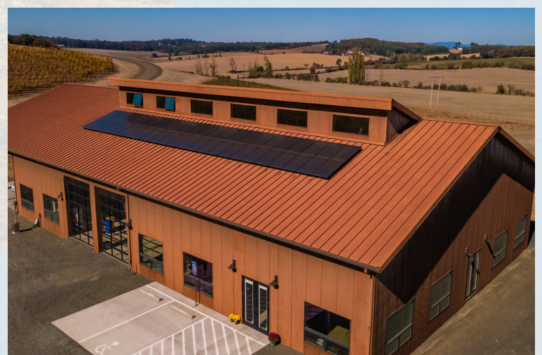
Adante Winery, Dallas, OR Featuring 18" MS200™ Roof Panels & Classic 7/8" Corrugated™ Wall Panels