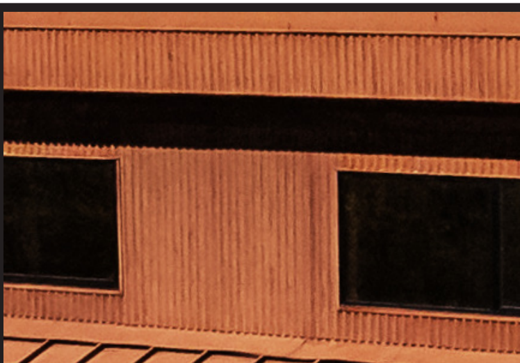
Adante Winery, Dallas, OR Featuring 18" MS200™ Roof Panels & Classic 7/8" Corrugated™ Wall Panels

Examples of the varieties of the possible natural finishes resulting with Rusteel Plus™.